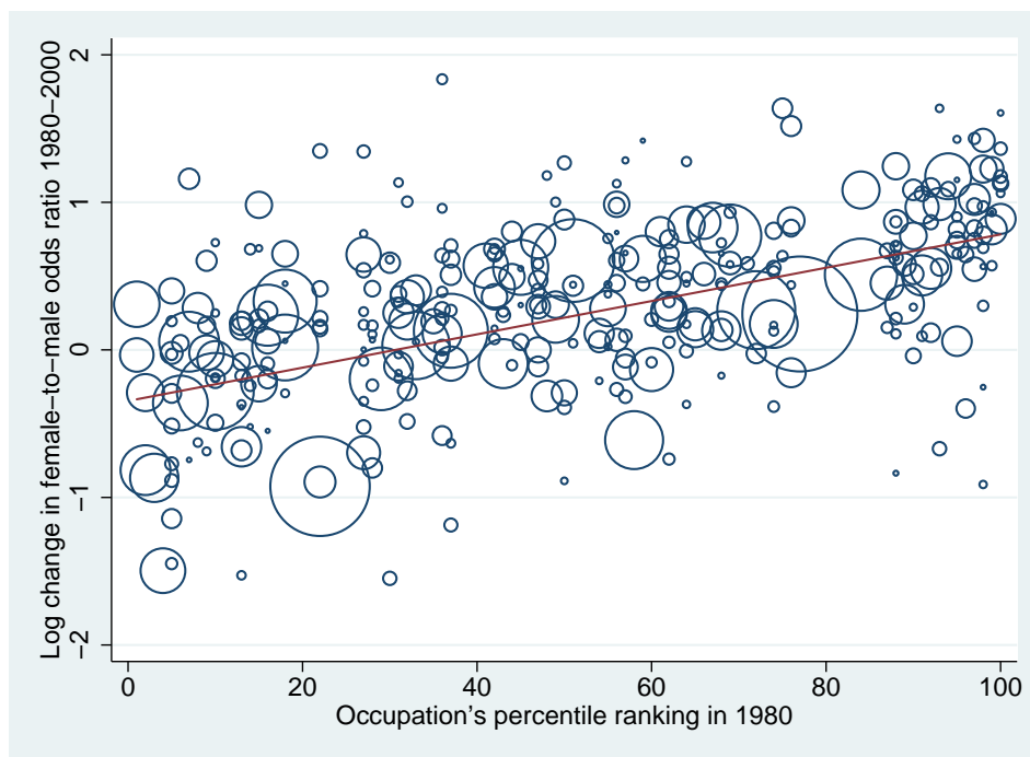
Figure A.1: Change in Female-Male Employment Probability and Occupational Wage Ranking

Notes: Each circle represents a 3-digit occupation, with the size of the circle corresponding to its share of total employment in 1980. Data on employment and wages from the 1980 and 2000 decennial censuses. See text for details.